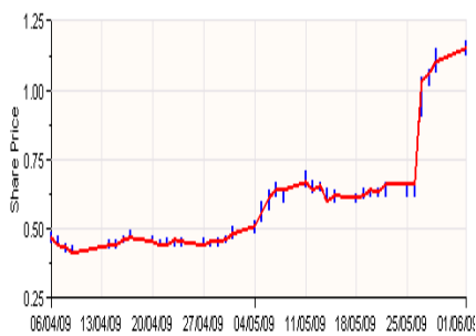
Figure 2: Price vs EPS